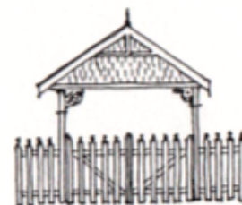
A SIMPLE CAR-PORT OF TIMBER CONSTRUCTION BLENDED WITH A FRONT PICKET FENCE