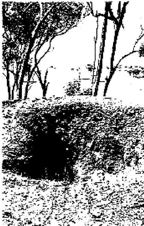
Another shaft on the Gunner's Dam property. The property owner's dog fell down this while chasing a rabbit, and it was only with the greatest difficulty that the animal was saved.