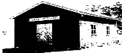
Curra Creek Public School