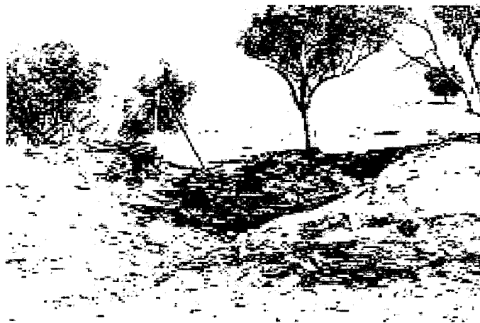
The mine at Gunter's Dam, as left by the last leasee, 1998