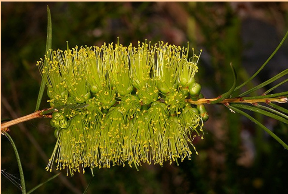
The common green-flowered form of Callistemon pinifolius

Callistemon pinifolius is usually an easily identified species because of its very narrow leaves, which are quite distinctive in comparison to the broader foliage of most other members of the genus.